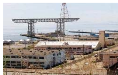
The Navy has spent $600 million to clean up contamination at its former Hunters Point base in San Francisco.

Cleanup work at many of the other heavily polluted pieces of land in San Francisco and San Mateo counties is overseen